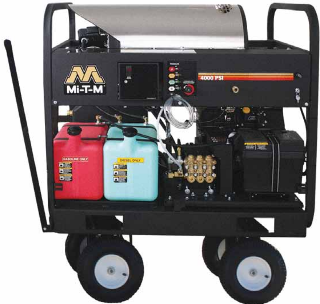
HDC-4004-0K6A shown with optional wheel kit (AW-5740-0000)