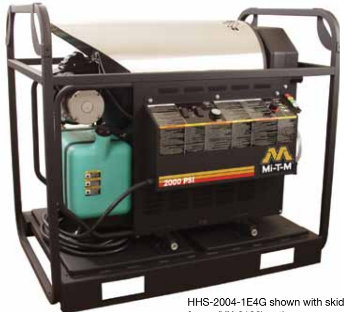
HHS-2004-1E4G shown with skid frame (HX-0196) option