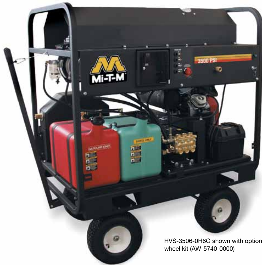
HVS-3506-0H6G shown with optional wheel kit (AW-5740-0000)