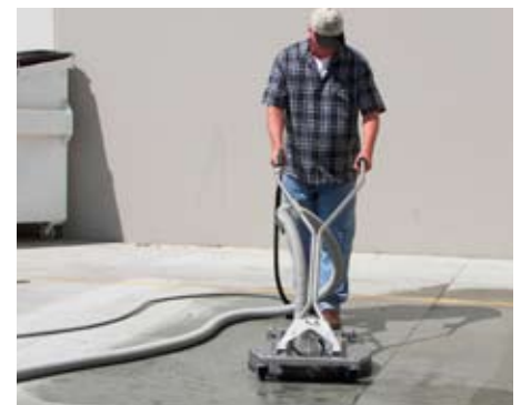
Optional ANTV3 Twister Vac for flat surface cleaning and water recovery in one step

Vacuum recovery rate may be inhibited if mounted higher than 30" from ground level