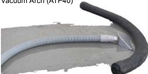
6' Foam Rubber Sand Berm (ZMAT7)