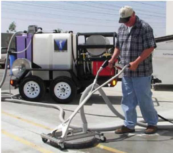
Your distributor can assist with other custom mounting options.