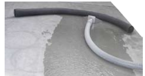
Turnkey system comes with 50' vacuum hose, scupper, and containment berms