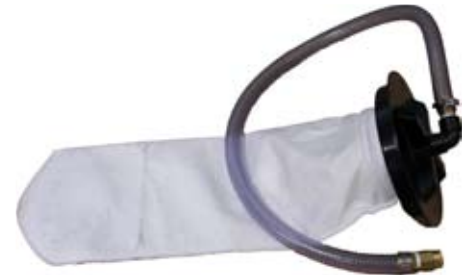
Includes tank lid, flange, and filter bag that connects the ZVAC to your recovery tank