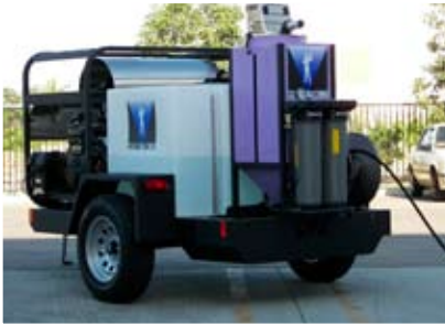
AZV is factory installed when ordered on Hydro Tek ProTowWash® trailer