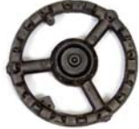
Gas Burner Ring

The Standard for Gas-Fired Pressure Washers. Impinging Jet Burner Rings offer the most efficient utilization of gas for heating water.