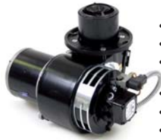
115 / 230 Volt