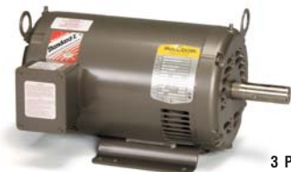
3 PHASE 184T FRAME