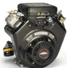
VANGUARD, V-TWIN OHV

Briggs & Stratton's top-of-the-line engines have proven performance in the pressure washer industry.