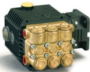
8.702-711.0 Gas Hollow Shaft Direct Drive Pumps