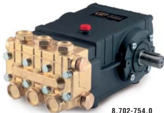
8.702-754.0 Solid Shaft Car Wash Pumps