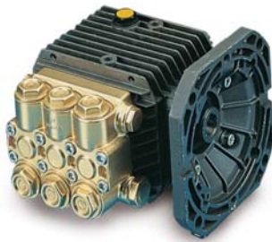
Hollow Shaft Direct Drive – Flanged for direct couple to electric motors