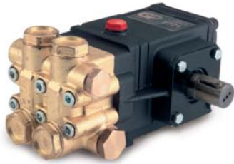
8.702-620.0 Solid Shaft Pumps