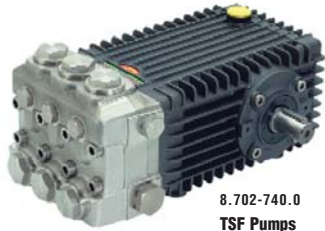
8.702-740.0 TSF Pumps