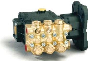
EZ Series Hollow Shaft Direct Drive – flanged for direct couple to gasoline engines