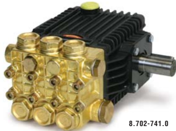
8.702-741.0 TX Solid Shaft Pumps