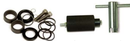
Piston Repair Kit