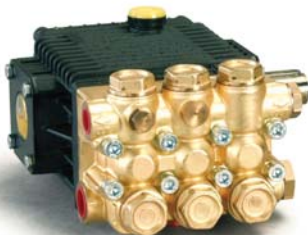
8.702-768.0 Series "44" Solid Shaft Pumps