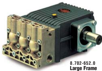
8.702-652.0 Large Frame Solid Shaft Pumps