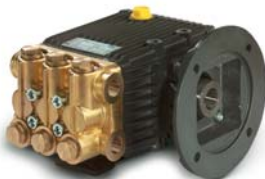
WJH-F & WJH

WJH-F SERIES: Triplex Plunger Pump with Bronze Connecting Rods 3450 RPM Direct Drive with 5/8" Hollow Shaft and NEMA 56C Flange, 3/8" inlet x 3/8" outlet, 13.2 lbs. Compare to: General Pumps – the TT series and AR Pumps – XTV series.